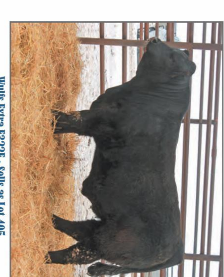
Wulfs Extra F322E · Sells as Lot 405